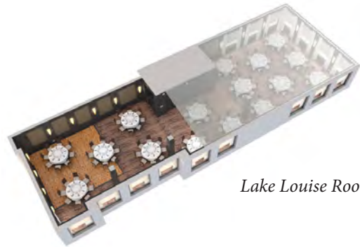
Lake Louise Room